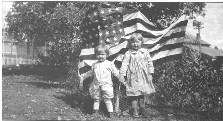
Two Young Girls from Rexford, 1910 (Scherer 6)